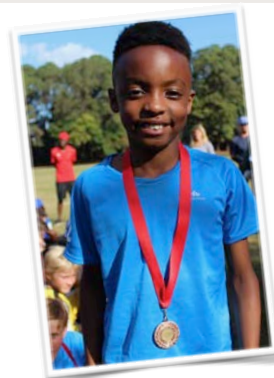
Matamando 3rd place, Inter-School Cross Country