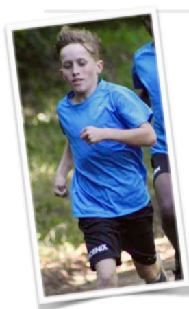
Taron 1st Place, Inter-School Cross Country