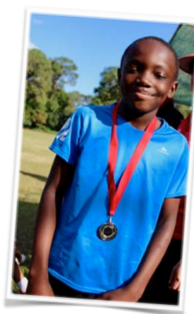
Mzati 2nd Place, Inter-School Cross Country & Victor Ludorum Inter-school Athletics