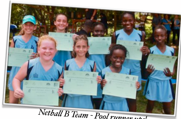
Netball B Team - Pool runner ups!