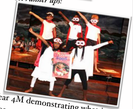
Year 4M demonstrating what it means to be a Reading Super hero!