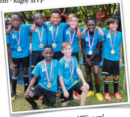
Rugby A Team - Pool Winners!